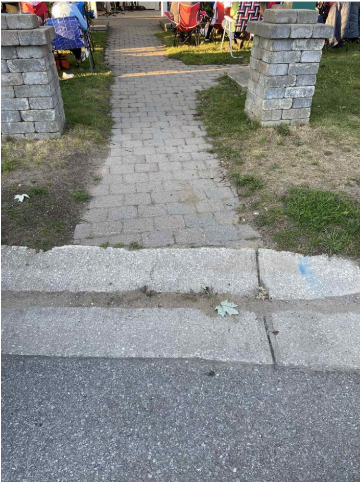
^ Trough area around Park