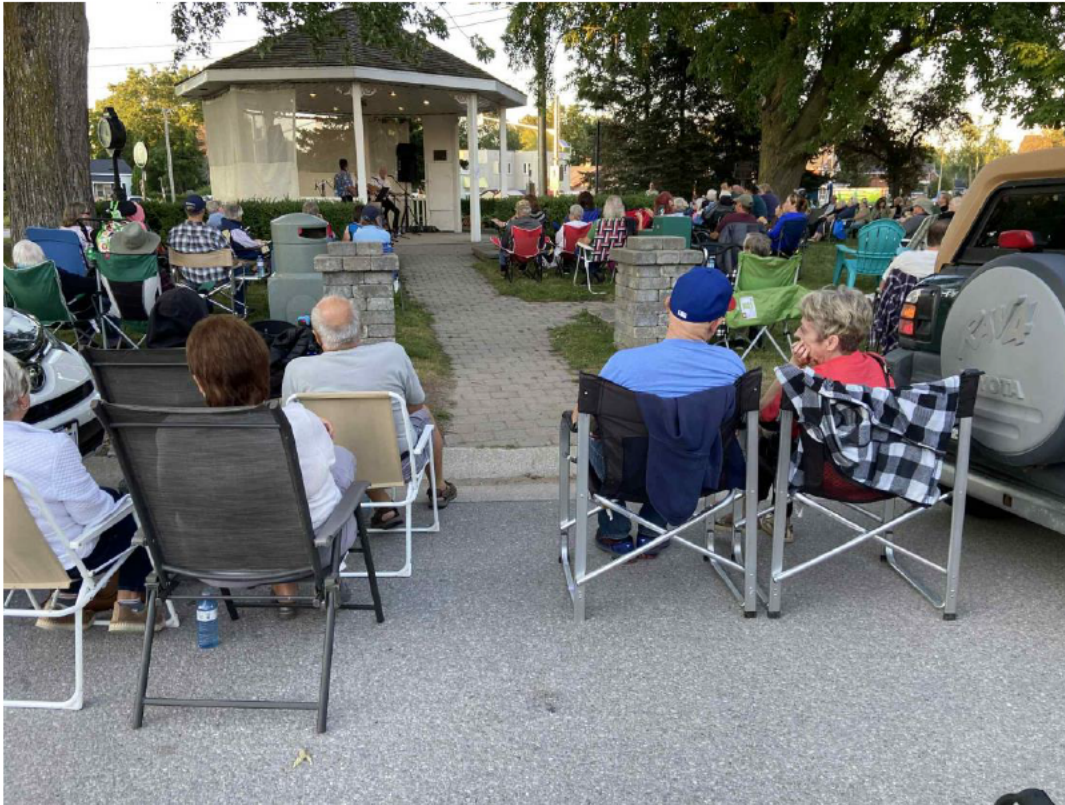
Photo above: sidewalk entrance blocked by attendees setting up chairs

Picture on right: cable/wire protector box not solving anything