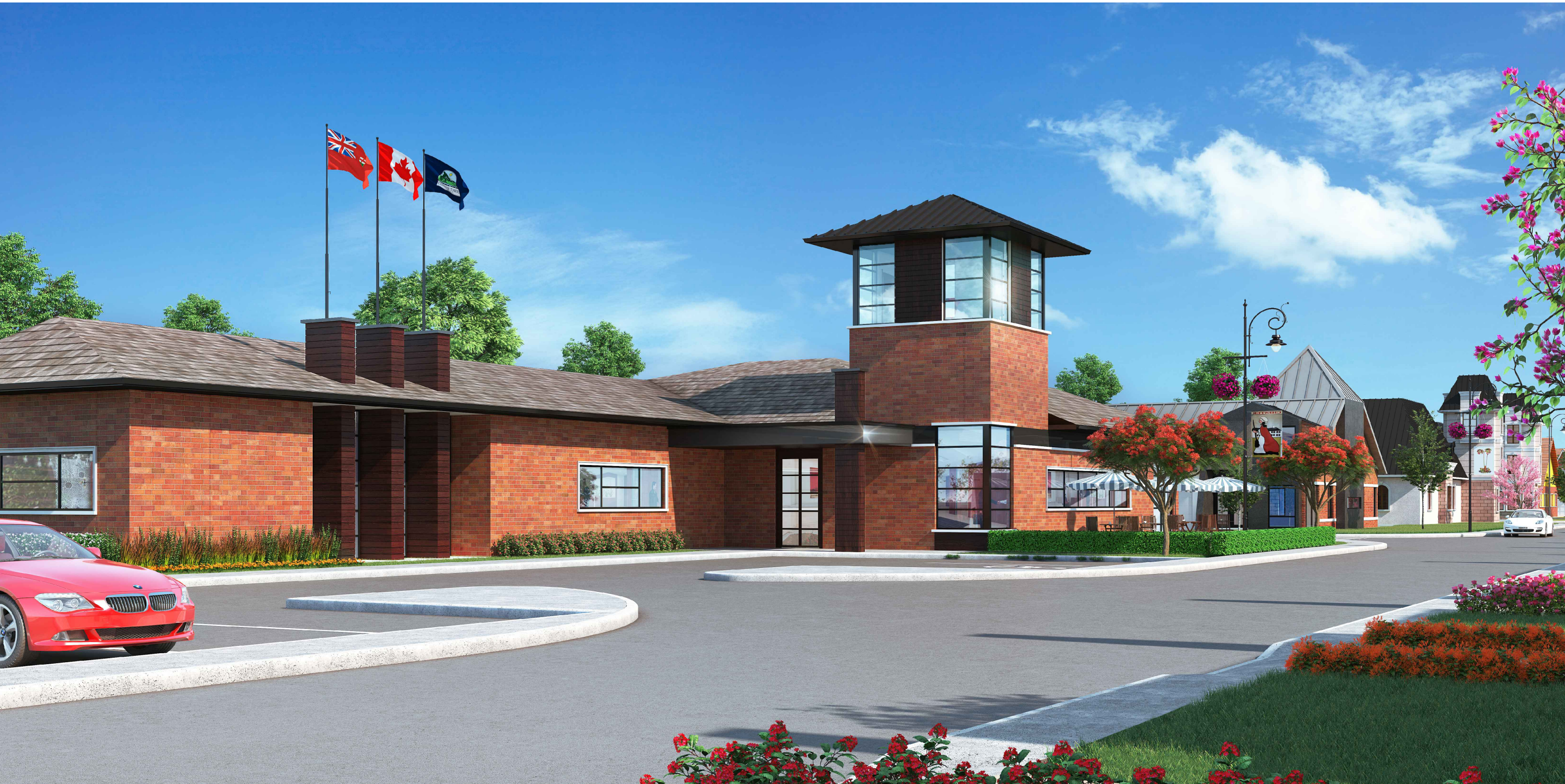
BUILDING FACADE FACING STREET A